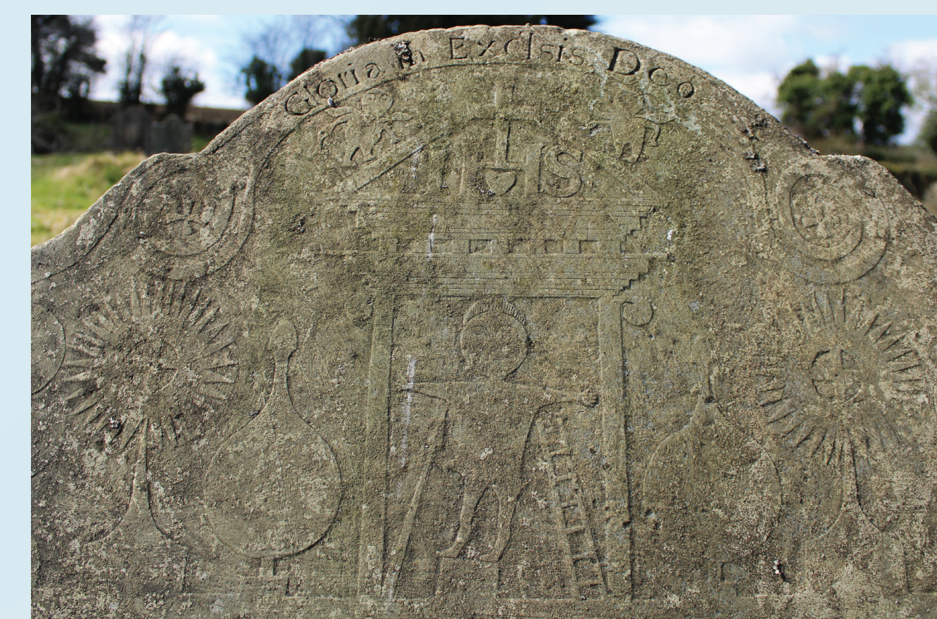
Cloch chinn 42 Higgins / Headstone 42 Higgins

The decoration on the Higgins headstone at Whitefield comprises a temple with scrolled capitals which frames a central depiction of Christ, representing his crucifixion. Christ's side is pierced with a spear and a ladder is also depicted. Two angels grace the top of the headstone, holding the keys to the gates of heaven. Flanking the temple are representations of a chalice and eucharist, monstrance, and thurible. The entire composition is elegantly framed by a scroll, with the words 'Gloria in Excelsis Deo' adorning the top of the headstone.