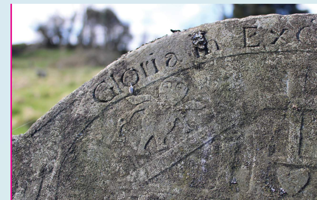
Cloch chinn 42 eochracha chuig geataí na bhflaitheas saor in aisce / Headstone 42 keys to gates of heaven