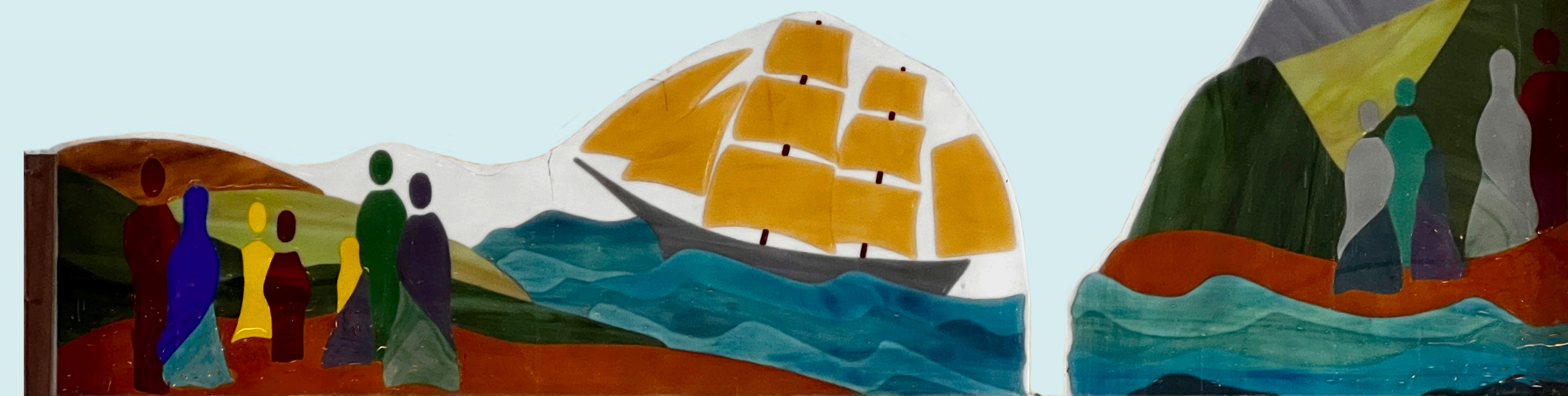
Killavaney church stained glass mirror detail commemorating the Irish emigration

In 1850, under the persistent threat of famine, Fr. Hore, the parish priest at the time, organized the migration of approximately 1,200 people from the area to the American mid-West, seeking a better future.