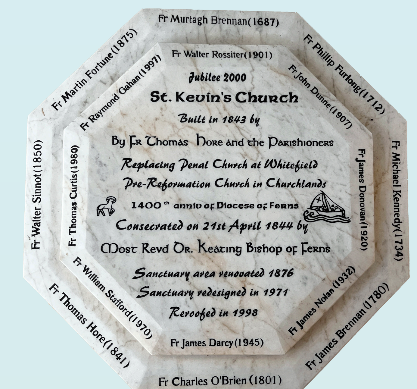
Plaque listing parish priests for Whitefield and subsequently Killavaney church