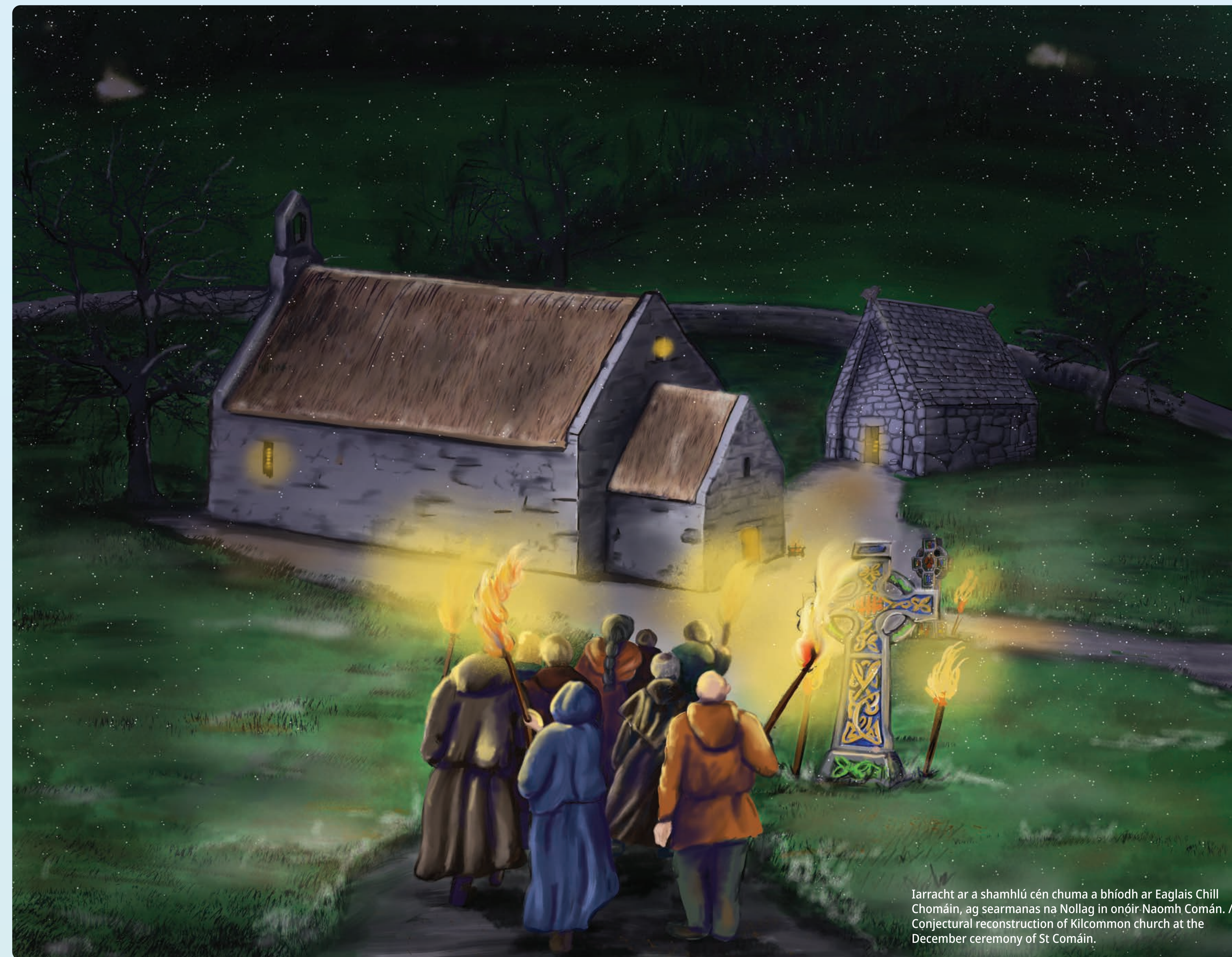
Iarracht ar a shamhlú cén chuma a bhíodh ar Eaglais Chill Chomáin, ag searmanas na Nollag in onóir Naomh Comáin. / Conjectural reconstruction of Kilcommon church at the December ceremony of St. Comáin.

The present-day Church of Ireland, known as Kilcommon Church, was built in 1820 and now occupies the original medieval church site, marking another chapter in the complex history of religious transformation in the area.