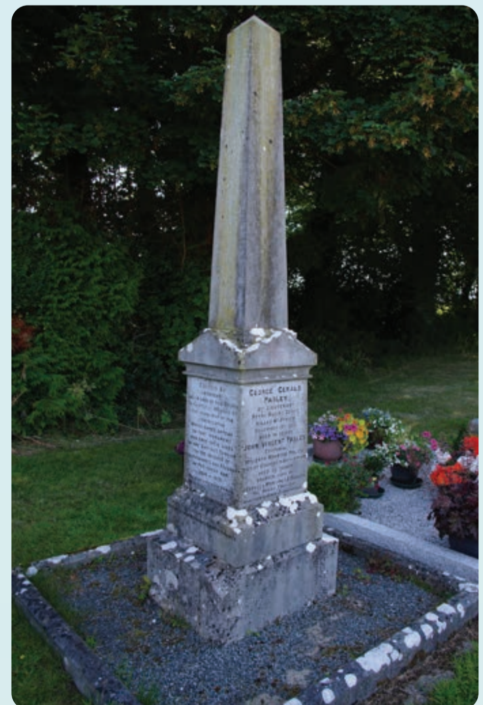
Leacht Cuimhneacháin don Chéad Chogadh Domhanda. / World War 1 Memorial.