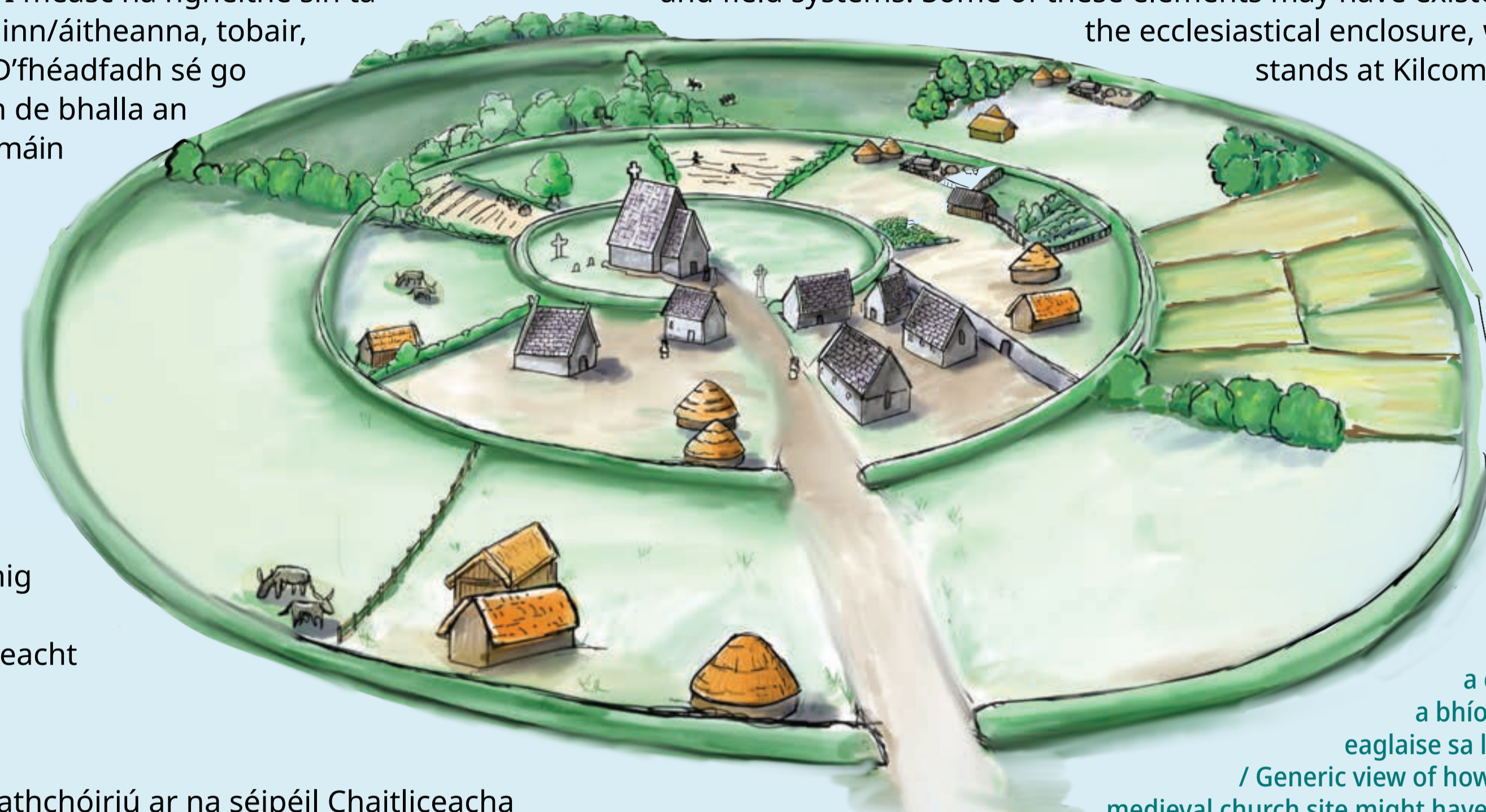
Amharc cineálach ar an leagan amach a d'fhéadfadh sé a bhíodh ar láithreán eaglaise sa luath-mheánaois. / Generic view of how an early medieval church site might have been organised.

Early medieval church sites like Kilcommon encompass various features such as churches and graveyards, dwellings, ovens/kilns, wells, mills, and field systems. Some of these elements may have existed outside the ecclesiastical enclosure, which still stands at Kilcommon today.