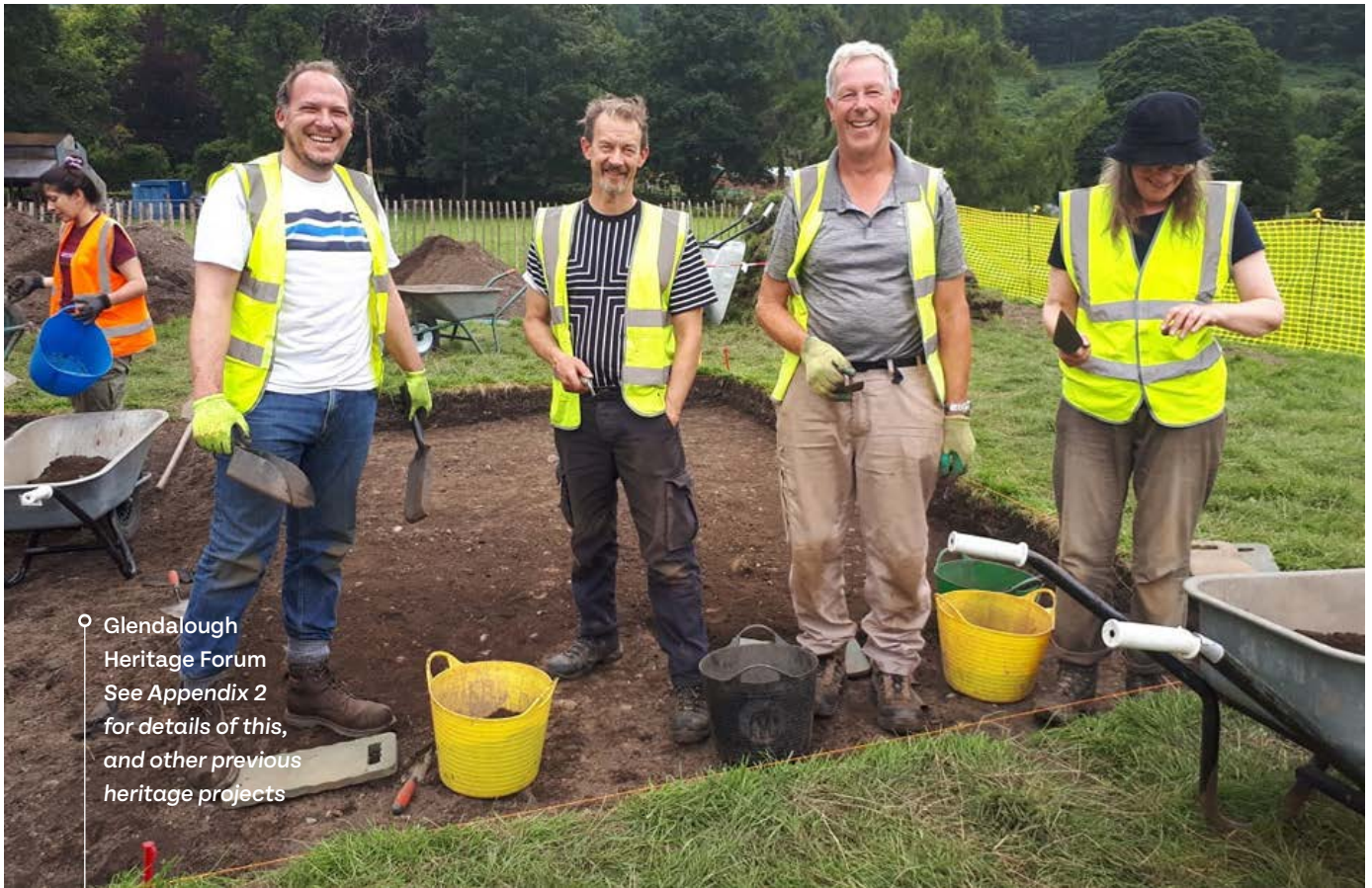
○ Glendalough Heritage Forum See Appendix 2 for details of this, and other previous heritage projects