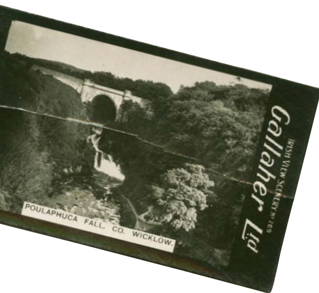
Early twentieth century cigarette card showing Poulaphuca Fall.

In terms of ranking priority themes for this plan, conservation and care for heritage emerged as a clear priority. Those consulted described priorities relating to protecting built heritage, including archaeological heritage e.g. holy wells, ringforts, and specific sites like the Baltinglass Hillfort Complex, and the architectural heritage of towns and villages such as Bray, Greystones and Delgany. Others described protecting biodiversity through for example, rewilding, rewetting bogs, protection of trees, landscapes and wildlife, and addressing coastal erosion. Prioritising the protection of aspects of cultural heritage was also raised from genealogy, heraldry, and traditional crafts and skills, to maritime heritage. Written submissions to the consultation also touched on these themes with many focussing on the protection of specific heritage sites or assets.