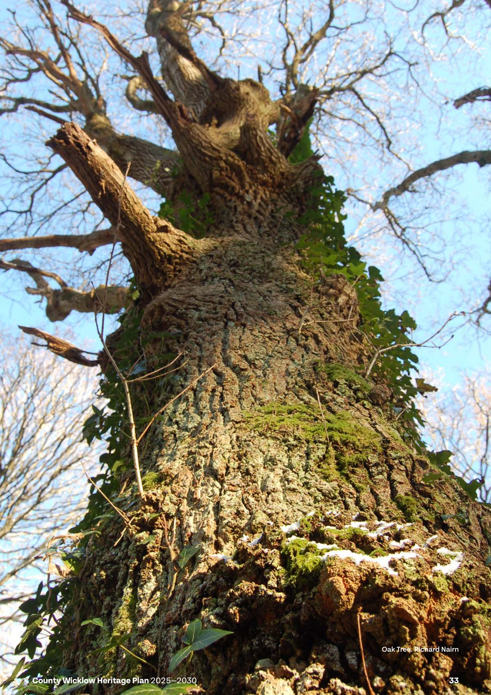
Oak Tree.