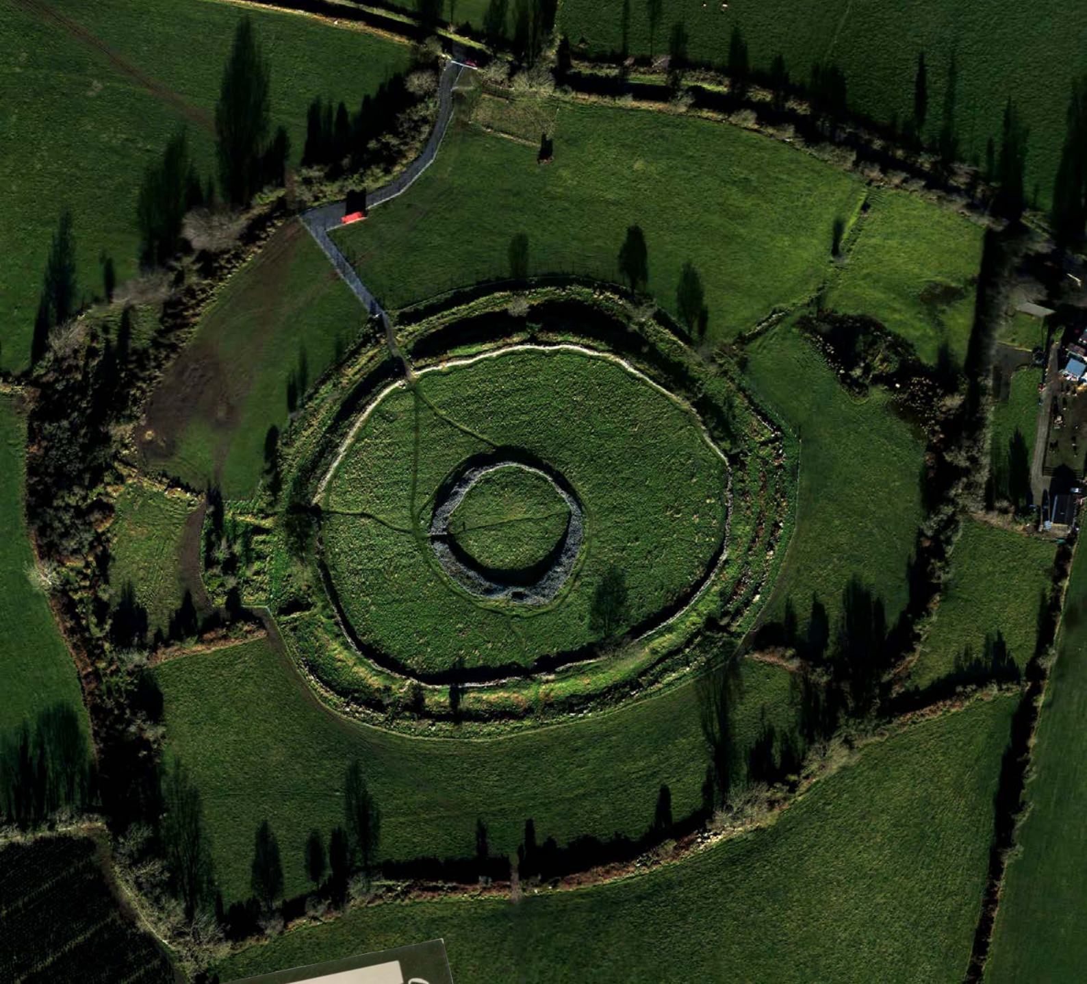
Rathgall hillfort.