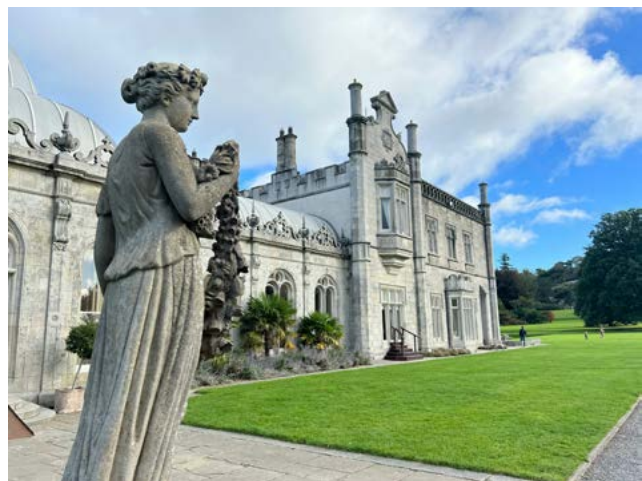
19 th Century Mining Buildings at Glenealo, Glendalough. Six spotted Burnet moth on Sea Holly at Brittas Bay. Killruddery House Bray