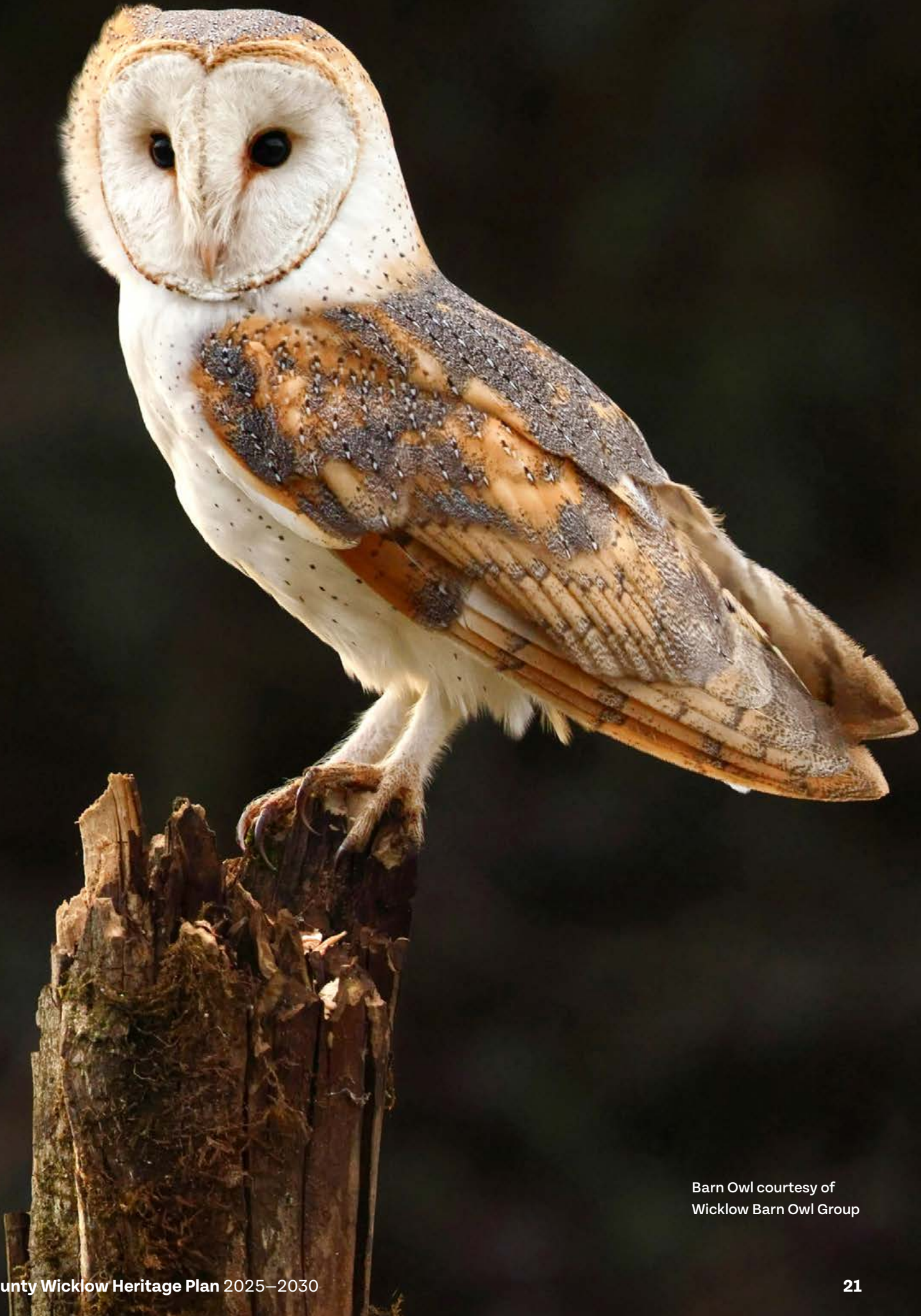
Barn Owl