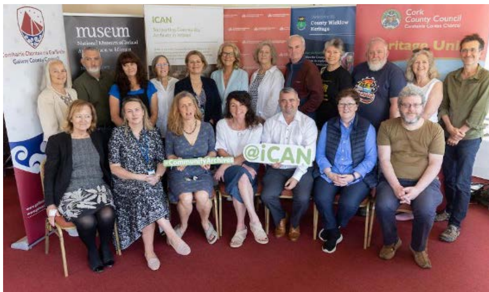
o ICAN Irish Community Archive Network (See Appendix 2 for details of this, and other previous heritage projects)