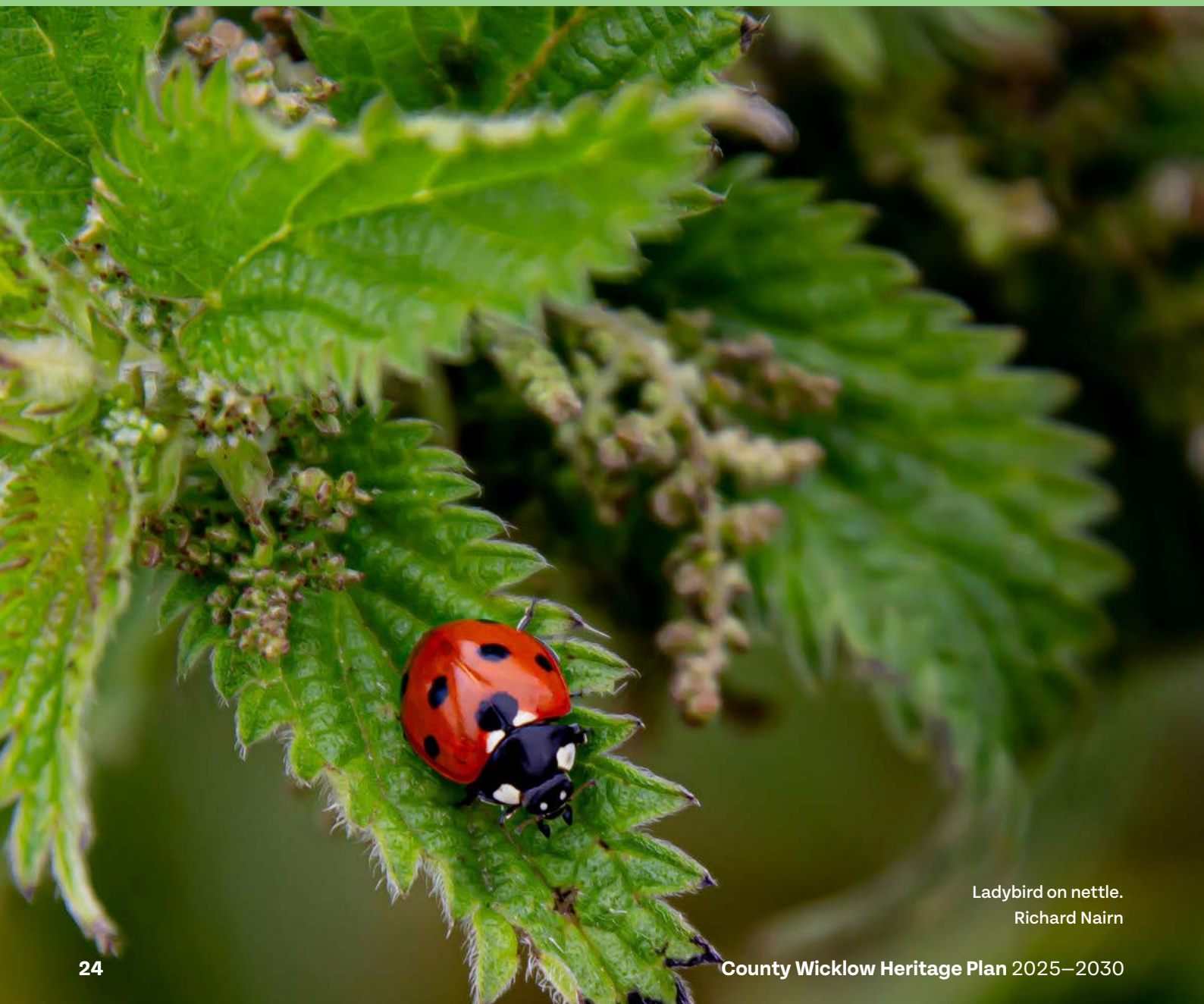
Ladybird on nettle.