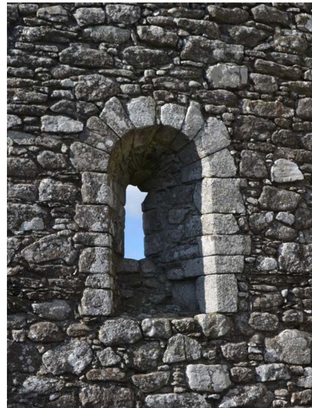
Above: Window at west gable of Aghowle Medieval Church

The main challenges perceived to heritage in Wicklow included the threats posed by population growth and housing, wind farm developments and the associated negative impacts on communities, biodiversity, landscapes, and the architectural and cultural heritage of towns and villages.