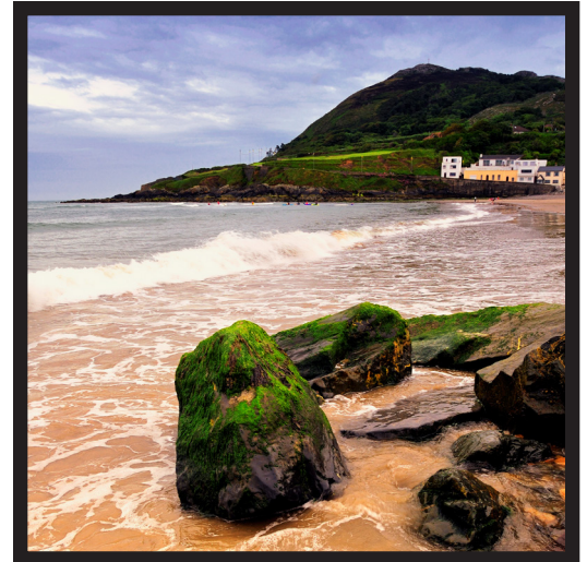
500 million year old Bray Head, one of Ireland's oldest rock-forms

11.15 am to 11.30am - Coffee Break and networking session