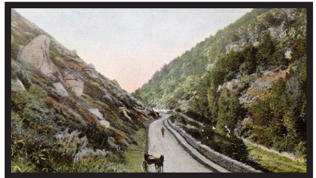
The Scalp near Enniskerry a major tourism attraction one hundred years ago