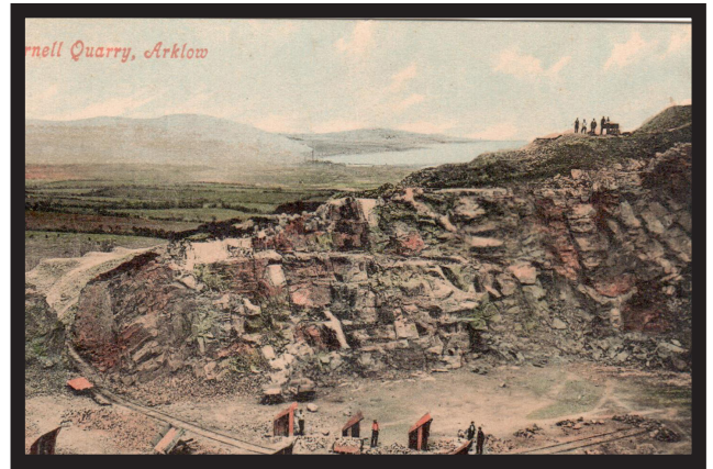
Charles Stewart Parnell's quarry at Big Rock Arklow, pictured over one hundred years ago