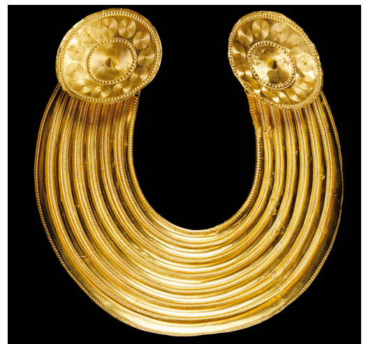
The area around Woodenbridge may have been the gold source for many artifacts