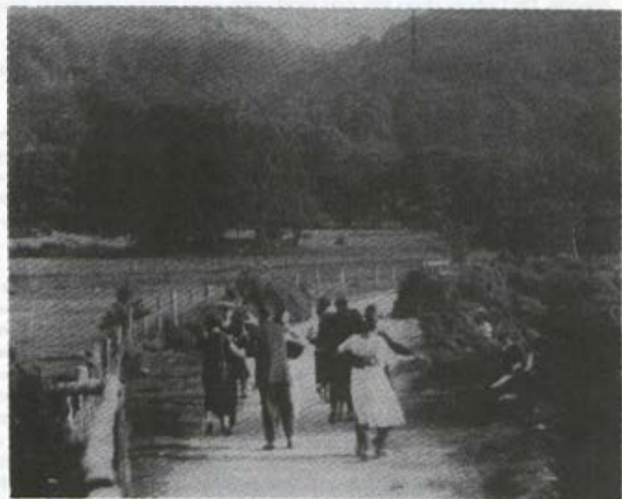
'Dancing At The Crossroads' Glendalough, Co. Wicklow. (Dark Island Collection No 119)

1/1/1850: A letter from 10 old Repealers of Trooperstown send 10/- to the Repeal Fund.